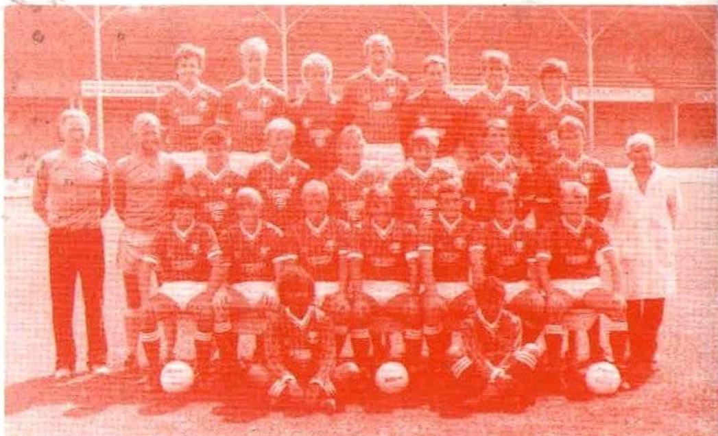
SWINDON TOWN SQUAD